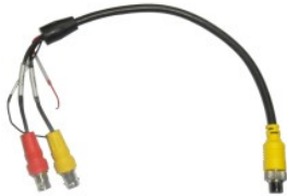
Female Transfer cable