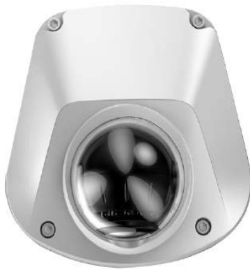
Dimension (Unit: mm)